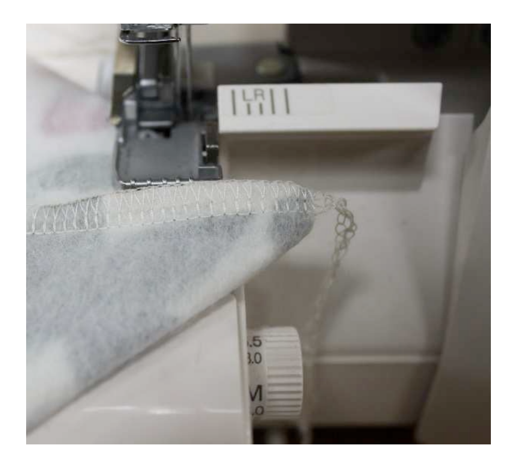
Repeat this for all four corners (including lining).