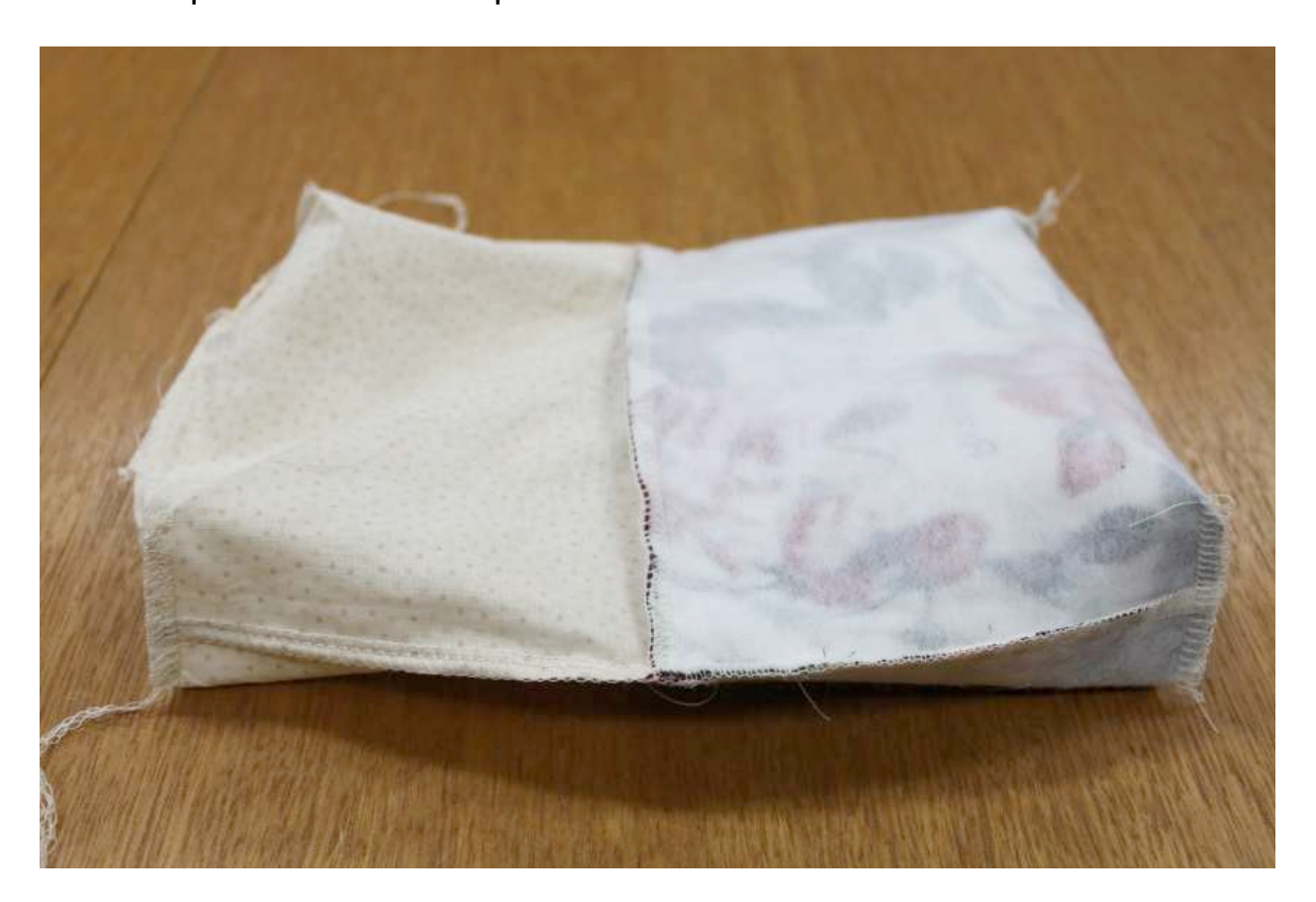
Turn the bag through the opening to the right sides.

Finish the opening in the lining by hand or sewing machine.