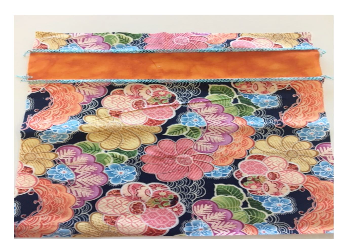
Fuse the pellon or fleece to the wrong side of the bag front

Open the zip fully and place the left side of the zip right sides down on the bag top, place lining piece right side down on top. See pic